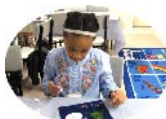
Children make banners to celebrate the coming winter.