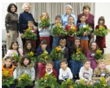
The Apple Blossom Garden Club members encourage future gardeners during a library workshop

T he Apple Blossom Garden Club invites children ages 6 to 11 to register for a special workshop for the RI Federation of Garden Clubs' standard flower show to be held at the Library on Wednesday, January 28 at 4:00 pm. The project is as follows: "Around the World in 80 Days... Up, Up, and Away!!" Our young enthusiasts are invited to decorate a hot air balloon using dried and/or treated plant material, beans, pods, etc. Some decorative materials may be used in addition to plant materials. The Garden Club will provide the balloon shape. Balloons will be suspended from a fishing line to show off the decorations on both sides of the balloon. Completed projects will be on display at the RI Convention Center in February and each piece will be judged. Registration begins on January 12. Children may pick up their arrangements at the library once the show is over.