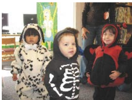
Toddlers dress for a Halloween storytime at the library.

The Bulletin boards and doorways in the Children's Room display artwork made by the children at the Greenville Nursery School. Visit the library to see how creative these young artists are!