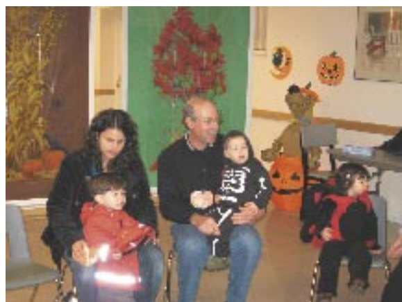
Tiny tots enjoy a pumpkin storytime during Turtle Time.

Children ages 5-10 may earn a free book simply by coming in to the Library during Children's Book Week, November 12-18, telling us what their favorite book is, and checking out a book to read. Catch up on those school assignments or just take out a fun book to read during Thanksgiving break. Children must show the librarian on duty in the Children's Room their library card and the book they are checking out to earn their free book. We will post a list of favorite books on our bulletin board!